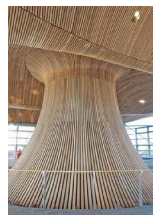
Welsh Assembly, Cardiff Cedar clad interior FR Specification: WPA Type INT2