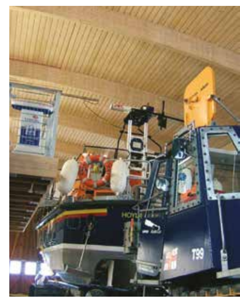
Hoylake Lifeboat Station Internal roof timber cladding FR Specification: WPA Type INT2