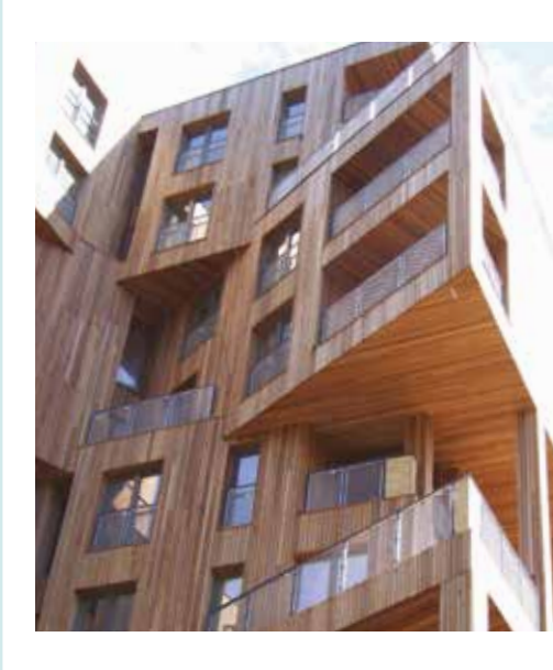
Banyan Wharfe Development, London External cedar cladding FR Specification: Type EXT (leach resistant) WPA Commodity code-FR5