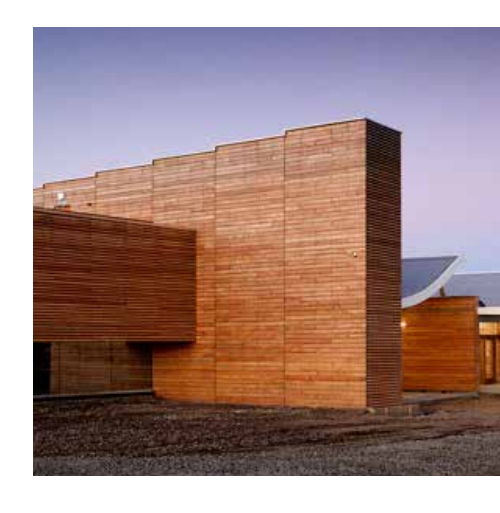
Culloden Battlefield Visitor Centre Internal and external Scottish Larch and Oak cladding FR Specification: WPA Type EXT and INT2