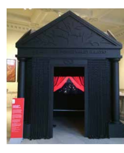
Art installation, V&A Museum Created using Medite FR panels