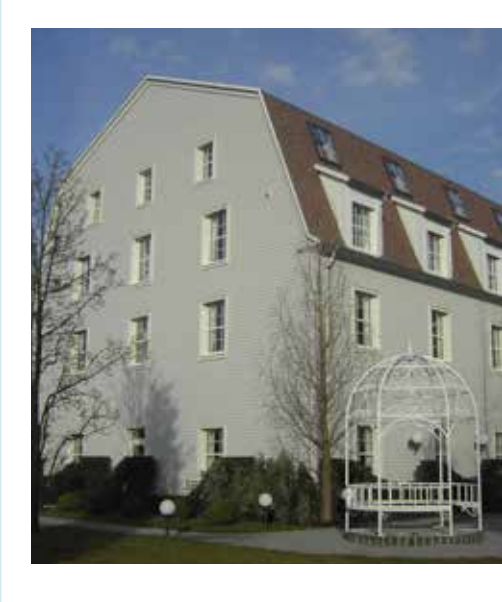
Bell Rock Hotel, Europa-Park External timber cladding prior to coating FR Specification: WPA Type INT2 (Humidity resistant)